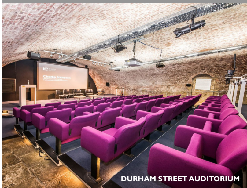
DURHAM STREET AUDITORIUM