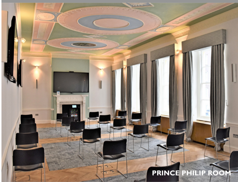
PRINCE PHILIP ROOM