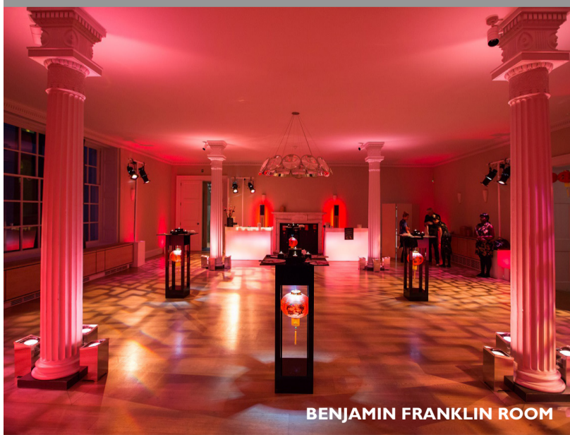
BENJAMIN FRANKLIN ROOM