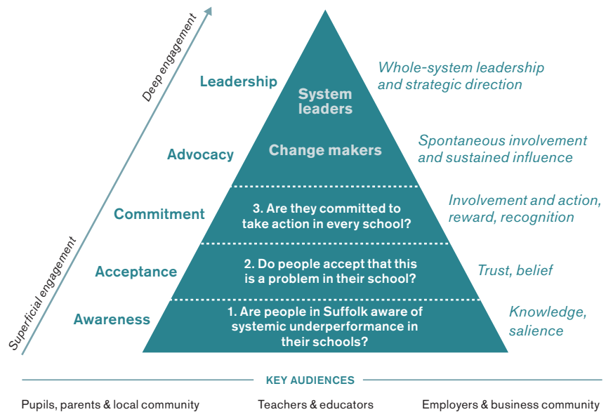
Figure 1a: A model of how engagement is built