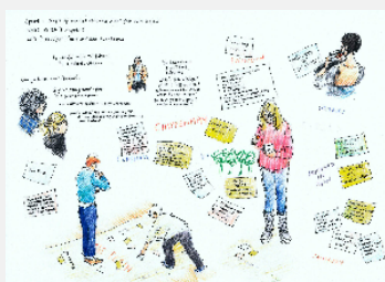
Artwork by Sarah Godshill

Creativity can be a powerful way of bringing people together to make change happen. Wiltshire has a wealth of people who work within the cultural sector, but they haven't had networks to link strongly them with the campus programme. Creative Gatherings are now starting to provide that link. From across Wiltshire, people from established arts organisations, museums, community based projects and online projects have come together to explore how arts practitioners can be more civically active with and through Campuses.