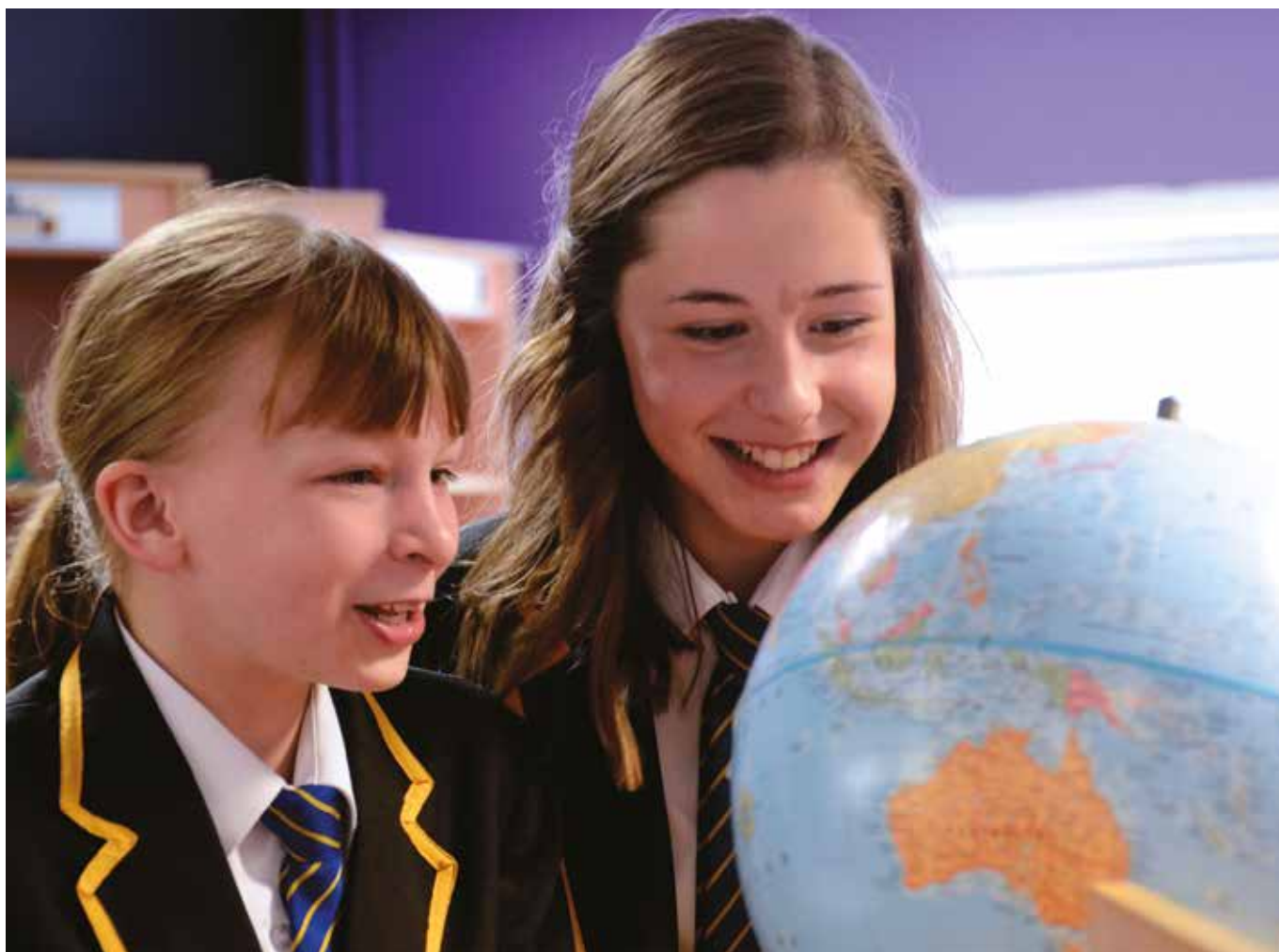
Students at Ipsley CE RSA Academy

The RSA's mission is to find innovative practical solutions to social problems. We do this through hands-on projects, research and our 27,000 Fellows around the world.