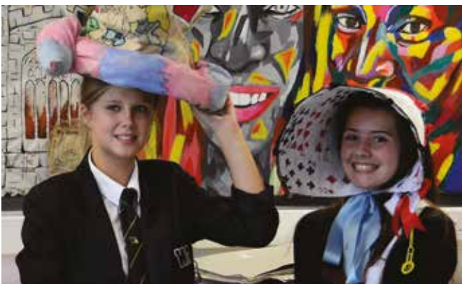
Students from Whitley Academy wearing hats they designed

We encourage teachers and learners to investigate ways to improve practice and school life, to work with colleagues across the RSA Family and participate in the wider work of the RSA to develop new ideas and share best practice.